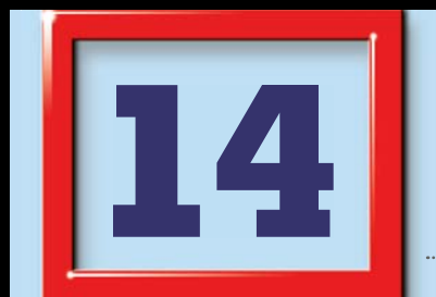
..... Date cursor and numbers in original size.