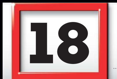
Date cursor and numbers in original size.