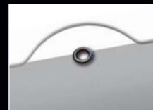
Calendar with hanger ...