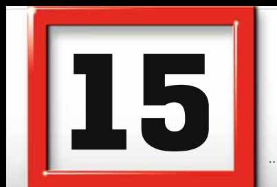
..... Date cursor and numbers in original size.