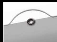
Calendar with hanger ...