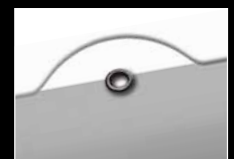
Calendar with hanger ...

Thereby, the transparent carrier film for the date cursor is slightly coloured, harmoniously coordinated with the colour of the previous and following months of your advertising calendar.